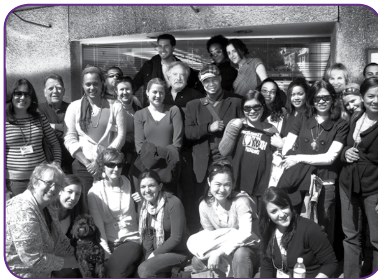
Huckleberry Youth Programs is committed to providing excellent youth programming in San Francisco and Marin Counties. Pictured: Huckleberry Youth Programs staff.