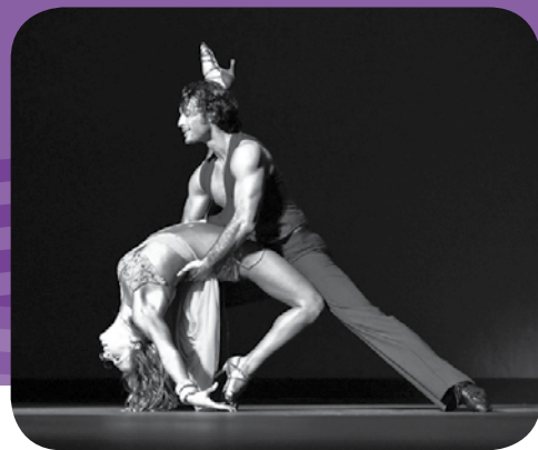
Edyta Sliwinska & Alec Mazo from Dancing with the Stars .

This year, the event will also feature a special performance by Edyta Sliwinska and Alec Mazo from Dancing with the Stars!