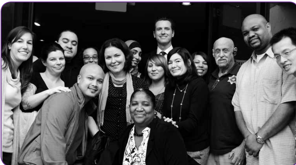
Mayor Gavin Newsom, back center, with Huckleberry Youth Programs staff.

On Thursday, February 25, Huckleberry hosted a special ribbon cutting ceremony at 44 Gough Street to recognize the Huckleberry CARC staff, our sub-contractors Brothers Against Guns, Instituto Familiar de La Raza, the Community Youth Center, and their commitment to providing arrested youth in San Francisco with an alternative to the juvenile justice system.