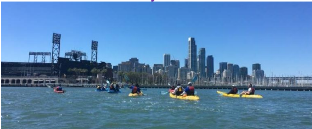
Youth in the Project READY program out on the San Francisco Bay with their Huckleberry case managers.

Modeled after our juvenile justice program, Huckleberry Community Assessment & Resource Center (CARC) , the goal of Project READY (Reconnecting, Educating, and Achieving Dreams for Youth) is to ensure that 8th graders with behavioral or truancy issues successfully transition to high school and avoid contact with the juvenile justice system.